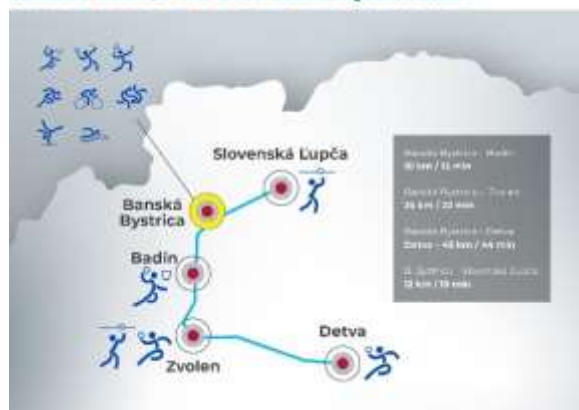
GENERAL MAP OF THE EYOF Banská Bystrica 2022